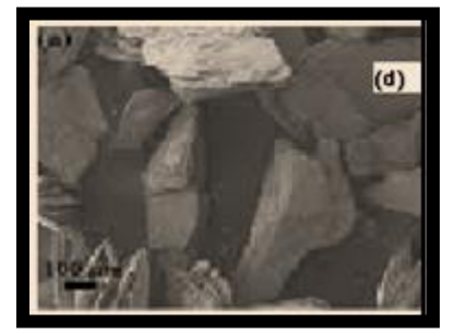
Fig: 1. SEM of Vermiculite at magnification 1800x (15kV)

The SEM of VC suggests a compact and less porous arrangement of ions in the adsorbent (Fig.1)